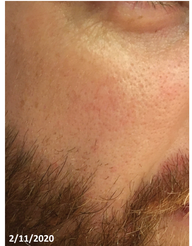
(RT) CHEEK - 16 DAYS OF USE

No remaining rash, razor irritation or redness. Lines softened, pores im- proved, skin hydrated and healthy.