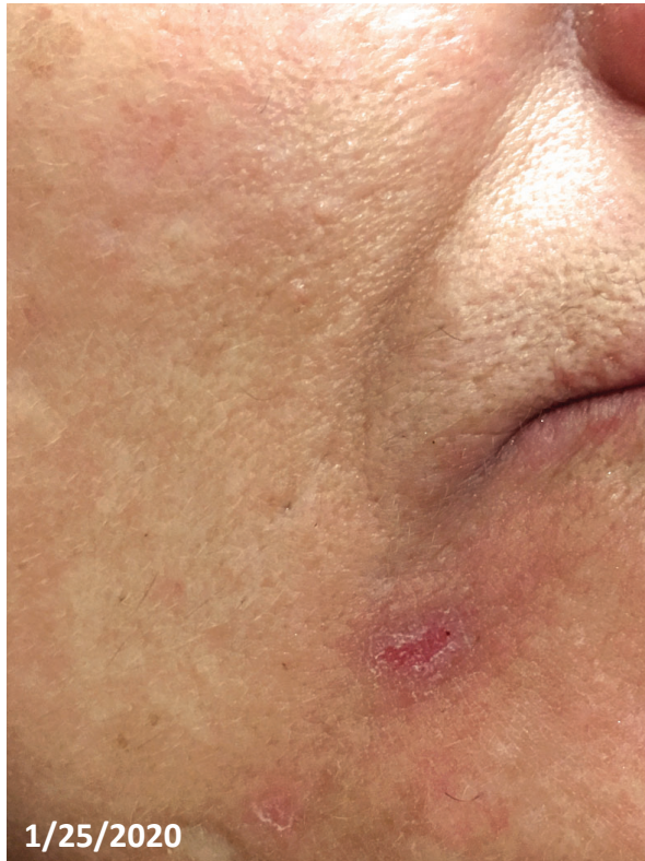
(RT) CHIN - BEFORE