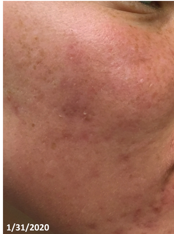
(RT) CHEEK - 6 DAYS