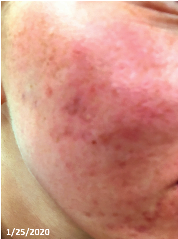
(RT) CHEEK - BEFORE