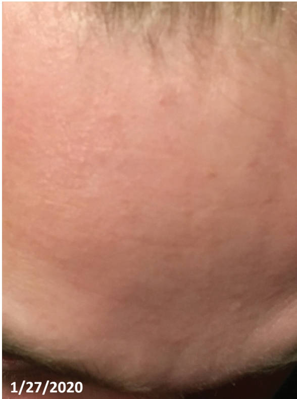
FOREHEAD - BEFORE

COMPLAINT: Unexplained bumps at hairline, dry skin, redness