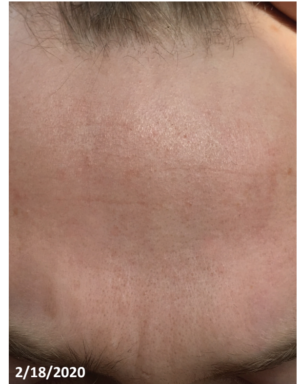
FOREHEAD - 21 DAYS OF USE

Bumps eliminated, skin is smooth, moisturized, very little redness.