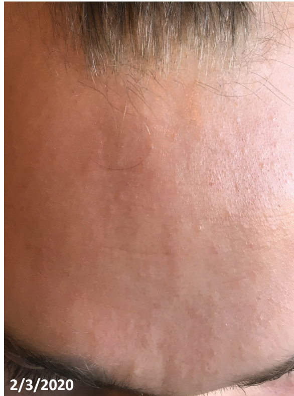
FOREHEAD - 7 DAYS OF USE

Reduced bumps at hairline, skin smoother, hydrated, redness fading