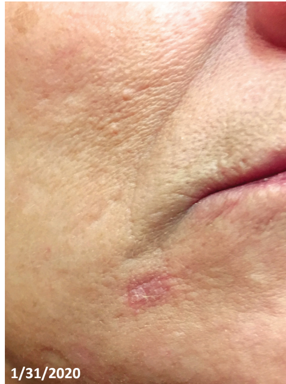
(RT) CHIN - 6 DAYS OF USE