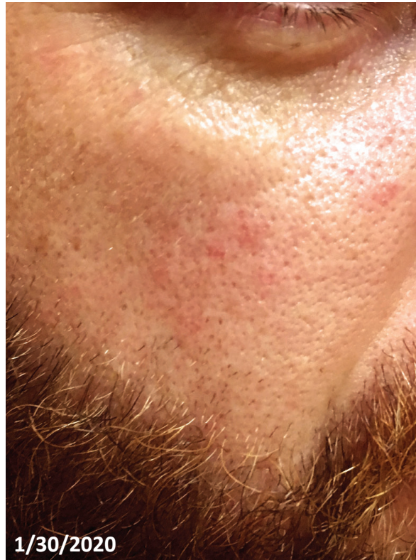
(RT) CHEEK - 5 DAYS OF USE

Rash healing, redness fading, pore shrinkage, fine lines softening