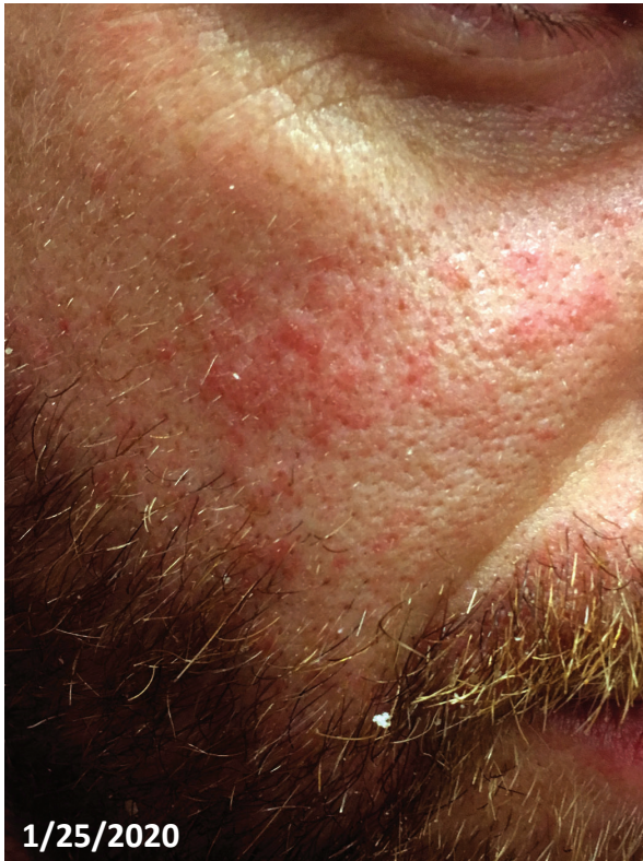
(RT) CHEEK - BEFORE

COMPLAINT: Unknown rash, redness, dry, flaky skin, razor irritation